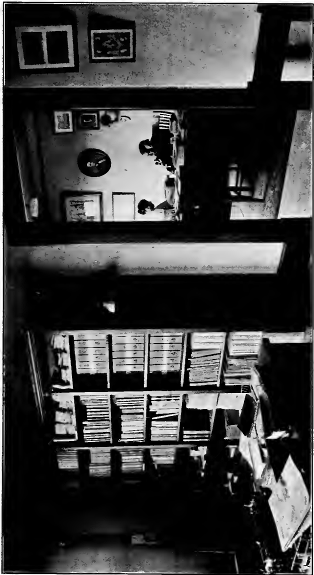
Keeping touch on religious movements at the national capital